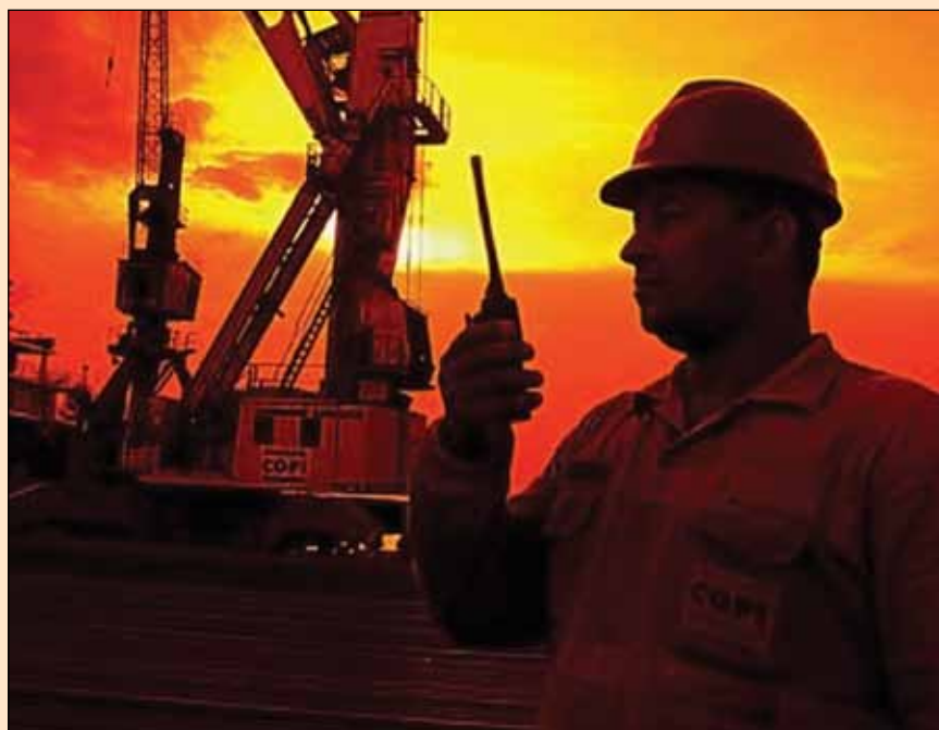
Port Itaqui, which will transfer the production of pulp, will receive investments of R$ 600 million

This previous knowledge of the place, together with the forest technology, was